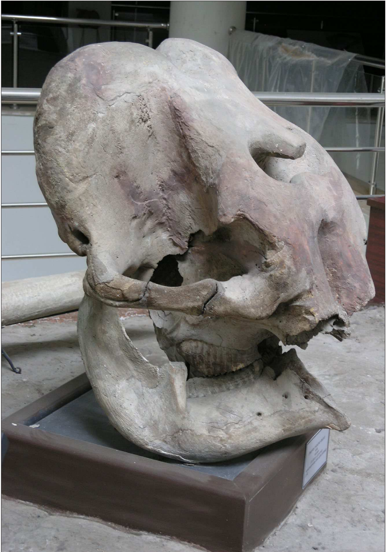
Figure 2: A partially reconstructed skull of Elephas maximus from Gavur Lake Swamp (MTA Natural History Museum, Ankara).